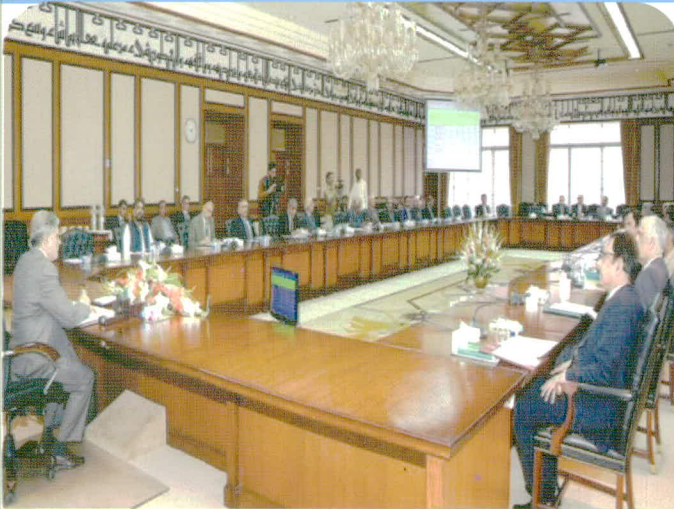
Finance Minister, Senator Mohammad Ishaq Dar chairing meeting of ECC in Islamabad on March 2, 2017.