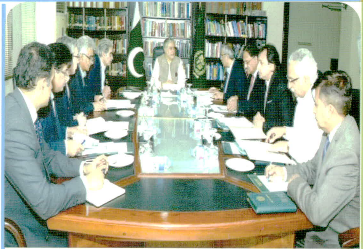
Finance Minister Senator Mohammad Ishaq Dar chairing a meeting on budget matters in Islamabad on April 15, 2017.