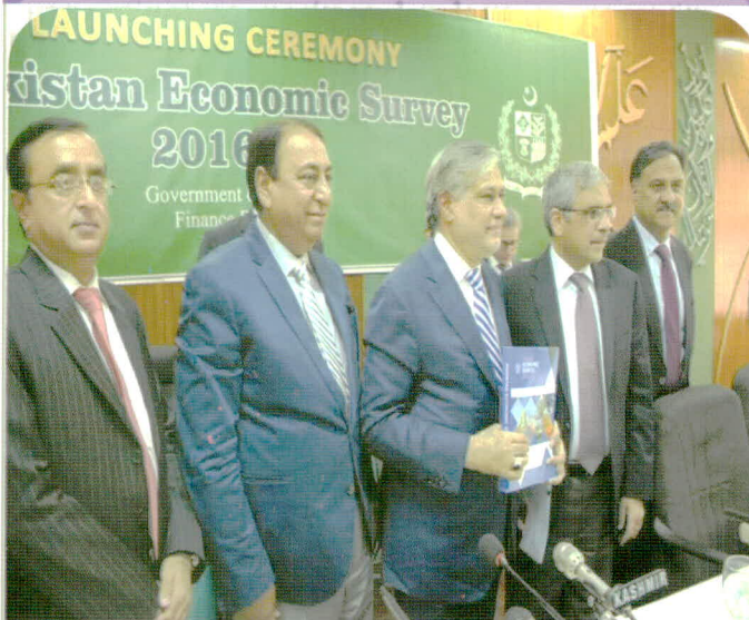
Finance Minister, Senator Mohammad Ishaq Dar displaying copy of Pakistan Economic Survey 2016-17 at a launching ceremony held in Islamabad on May 25, 2017.