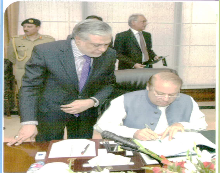
Prime Minister Muhammad Nawaz Sharif approving Budgetary and Taxation proposals for FY 2017-18 after Cabinet meeting at Islamabad on 26th May, 2017.