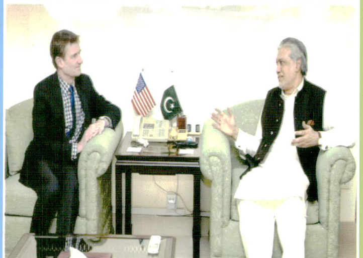
Finance Minister, Senator Mohammad Ishaq Dar in a meeting with US Ambassador David Hale at M/o Finance, Islamabad on June 3, 2017.