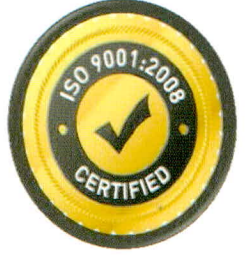
Finance Division Government of Pakistan