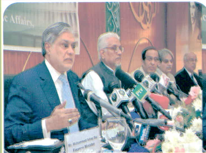
Finance Minister, Senator Mohammad Ishaq Dar addressing post budget press conference in Islamabad on June 6, 2015