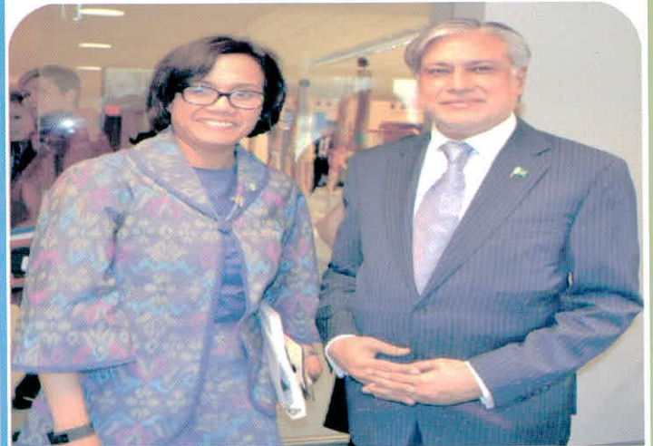
FINANCE MINISTER, SENATOR MOHAMMAD ISHAQ DAR MEETING WITH MS. SRI MULYANI INDRAWATI MD WORLD BANK WASHINGTON DC APRIL 19, 2015