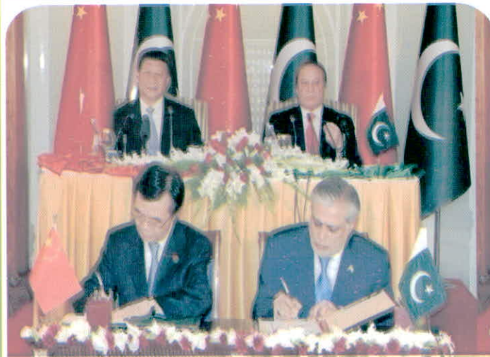
Finance Minister Senator Mohammad Ishaq Dar and a Chinese official signing MoU in presence of Prime Minister Muhammad Nawaz Sharif and Chinese President Xi Jinping at Prime Minister's Office, Islamabad April 20, 2015