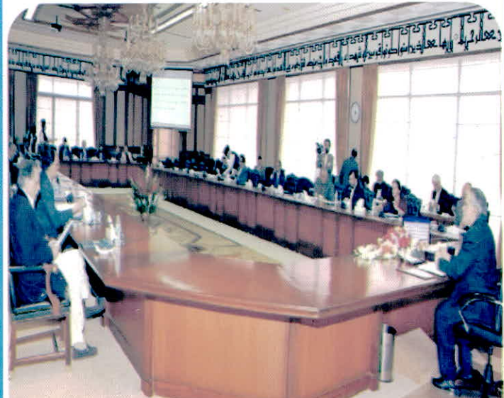
Finance Minister Senator Mohammad Ishaq Dar chairing the ECNEC meeting in Islamabad on December 19, 2015.