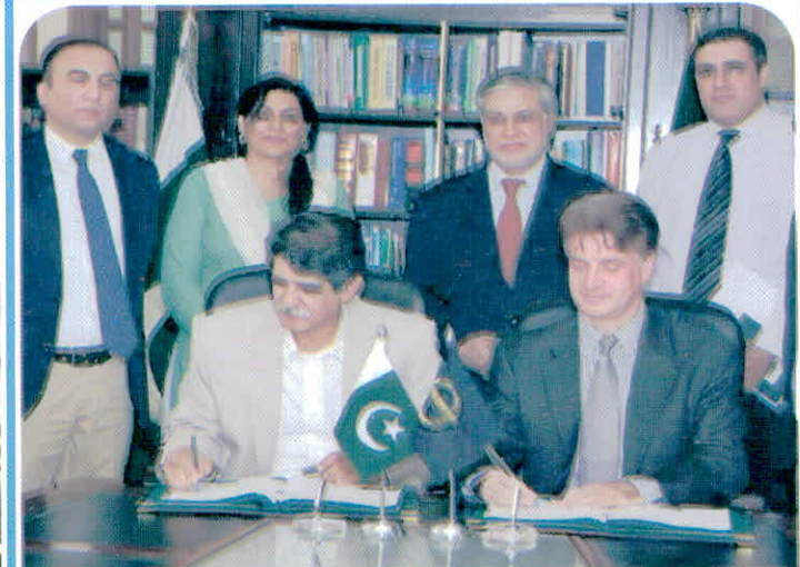
Finance Minister Senator Mohammad Ishaq Dar witnessing agreement signing ceremony between EAD and ADB at Ministry of Finance on July 9, 2015