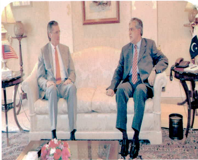
US Ambassador Richard G. Olson called on Finance Minister Senator Mohammad Ishaq Dar in Islamabad on August 26, 2015.