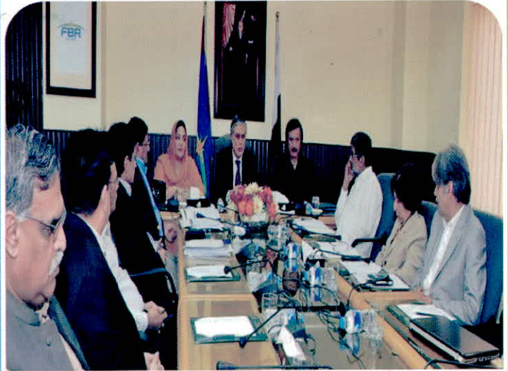
Finance Minister Senator Mohammad Ishaq Dar chairing second meeting in FBR, Islamabad on matters regarding filing of e-returns in Islamabad on September 19, 2015.