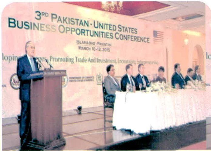
Federal Minister for Finance, Senator Mohammad Ishaq Dar addressing the inaugural session of 3rd Pak-US Business Opportunities Conference in Islamabad on March 10, 2015.